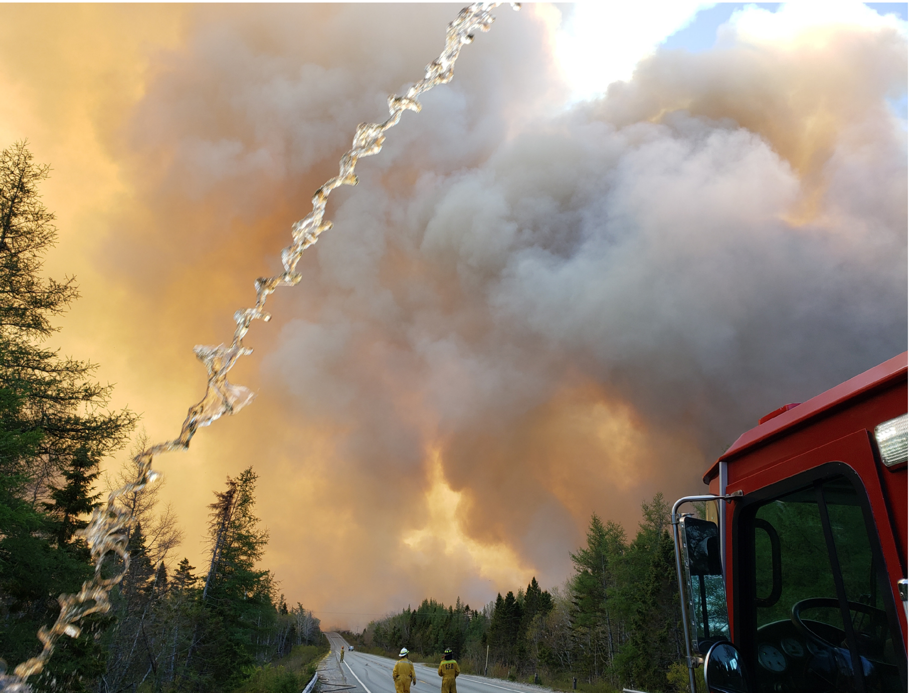
Apocalypse Here - Shelburne County, June 2023