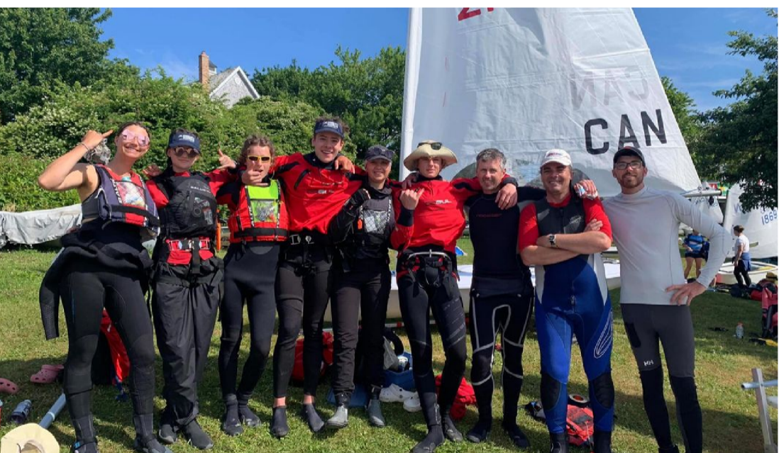
The posse representing SHYC at Baywind.